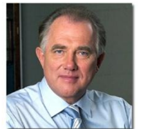
Halldór Ásgrímsson Secretary General, NCM