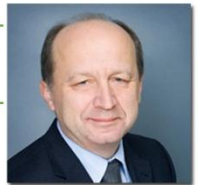
Andrius Kubilius Prime Minister of Lithuania