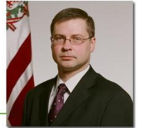
Valdis Dombrovskis Prime Minister of Latvia